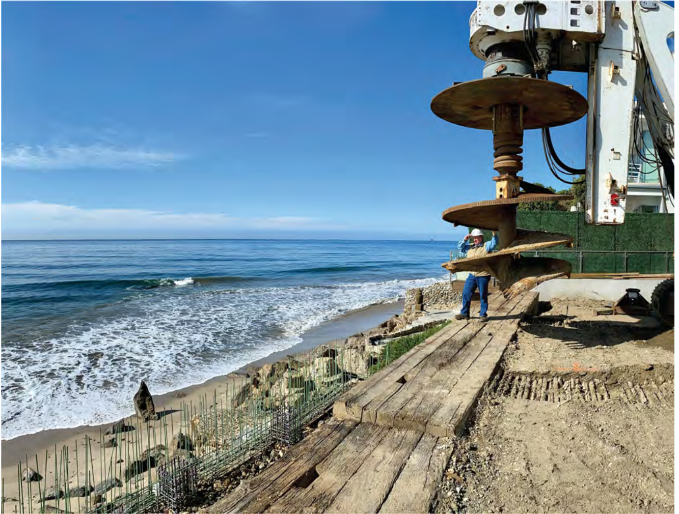
DALE SCHEFFLER ON THE MALIBU ROAD JOBSITE