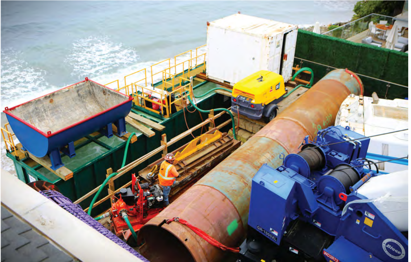
CAREFUL STAGING OF EQUIPMENT, TOOLING AND MATERIAL WAS CRITICAL

new scenario would have to be evaluated for each shaft. Dale moved his models around like pieces on a chessboard, determining different staging area designs for each of the eight foundation piles. The models demonstrated that the work could be safely done.