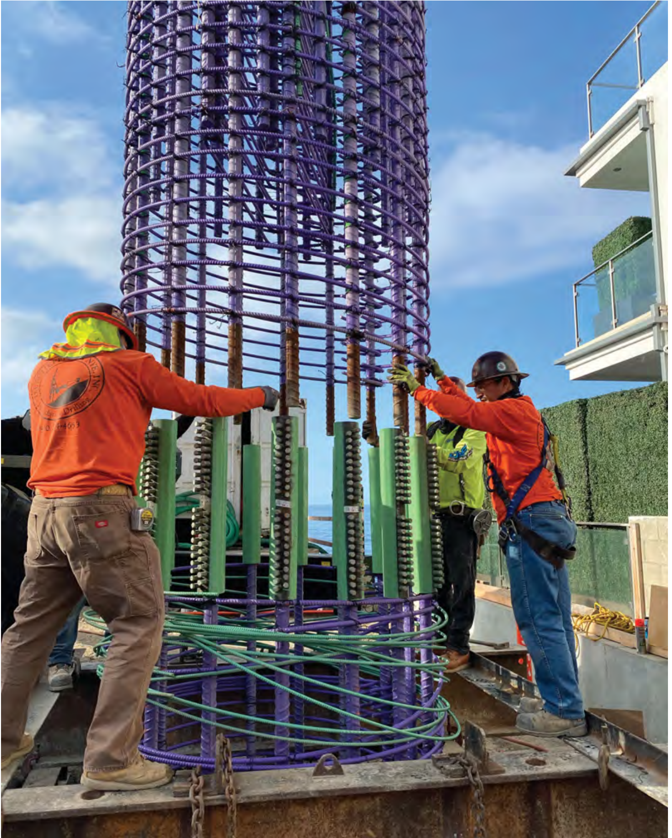
PREPARING TO COUPLE CAGE SEGMENTS ON SITE

Once the drill reaches bedrock, a 6-foot diameter inner casing is inserted inside the 7-foot diameter surface casing and dropped down the shaft until it reaches bedrock. A seal is formed to hold off intruding water when the casing is twisted into the bedrock.