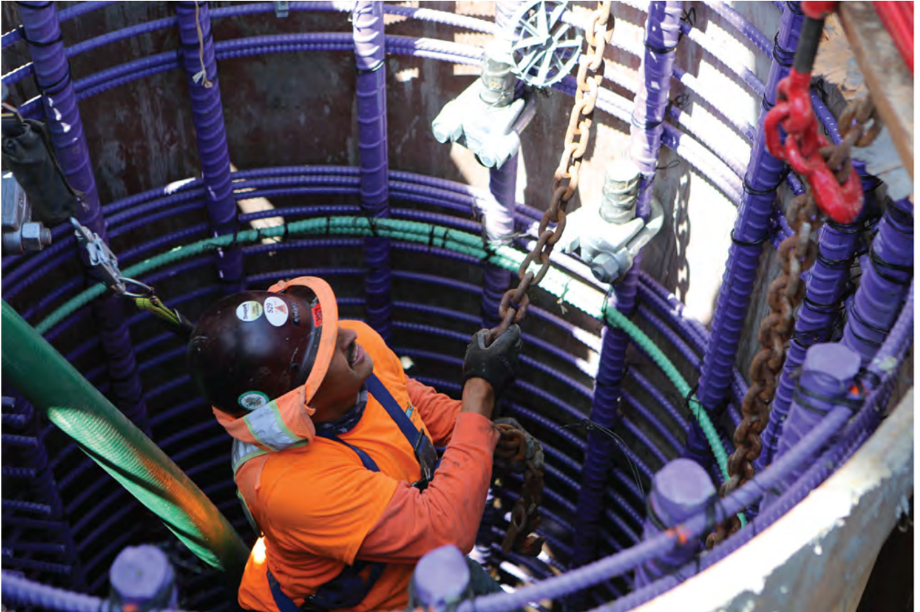
ADJUSTING THE REBAR CAGE PLACEMENT PRIOR TO THE CONCRETE POUR

The diameter of this inner casing matches the shaft size of the pile specified by the engineer. With the casing in place, the drilling of the shaft continues into the rock socket to the depth needed to install the rebar cage.