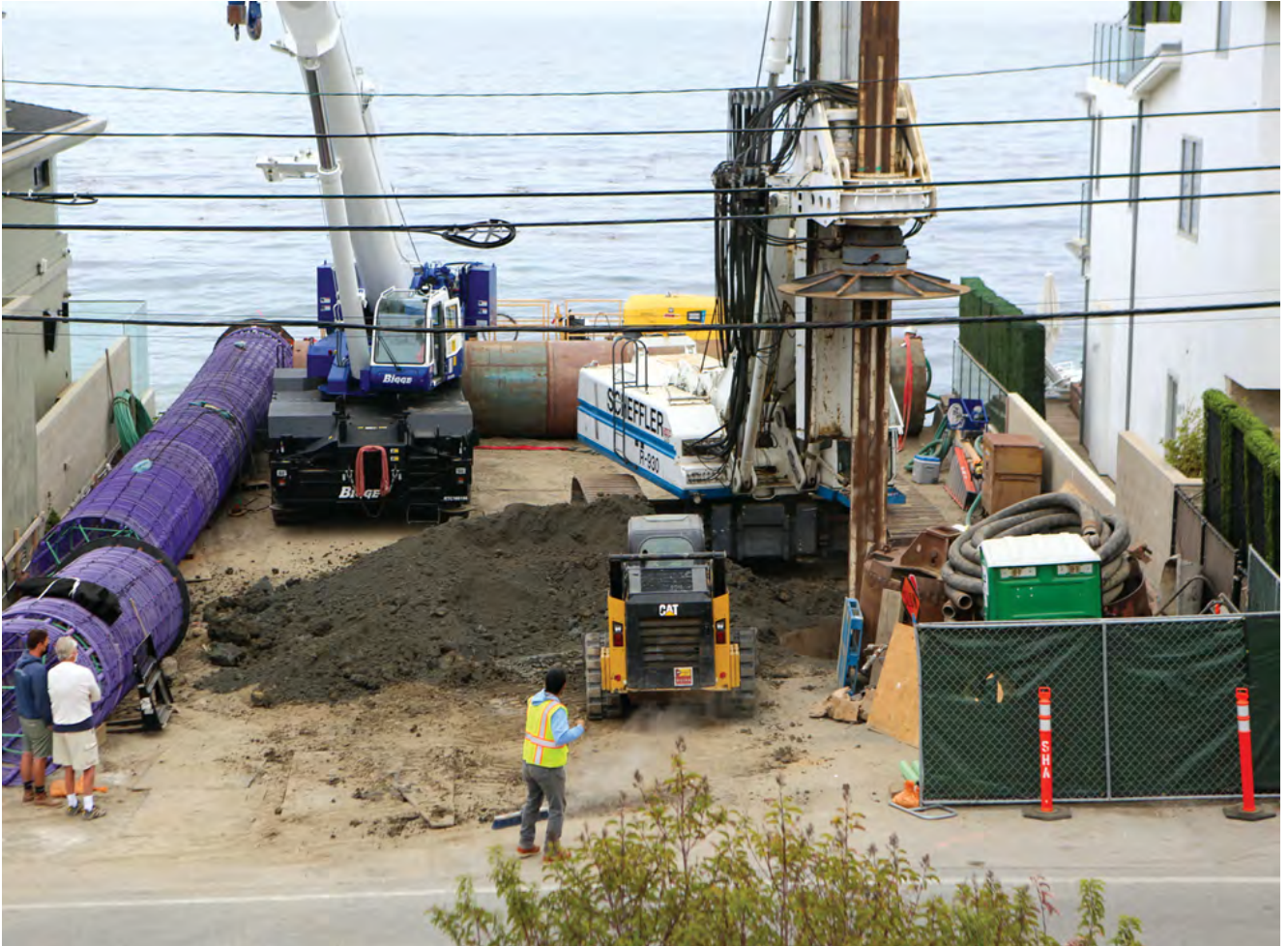
STREET VIEW OF THE CONGESTED JOBSITE

mechanism for foundation drilling contractors. For Scheffler & Nye, the real interest lies below the surface. It is about having first-hand knowledge of the geological features and soil makeup of the subsurface. It's about truly understanding the lay of this unique stretch of land.