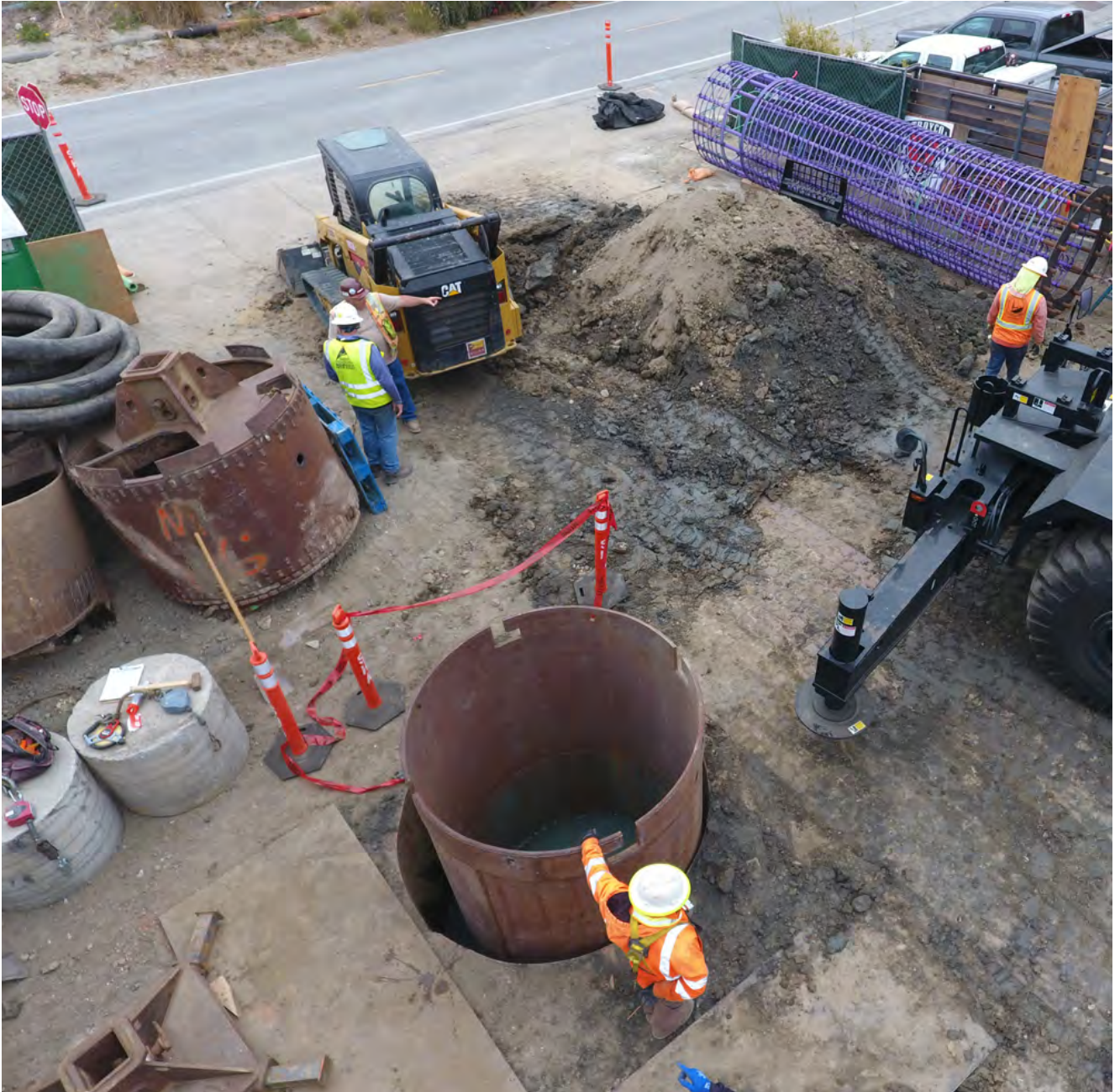
PLACEMENT OF THE SURFACE CASING

The first part of the process was to prepare the area where each pile would be drilled. At each designated drilling location, a 7-foot diameter surface casing needed to be installed. These casings were placed in shafts that were drilled down to 15 feet below the surface grade. Along with providing the crew more room to make necessary adjustments during the construction of the permanent piles, the surface casings would be integral to the introduction of the polymer slurry into the drilling process. But for the time being, the installed casings were backfilled with native spoils from the excavation.